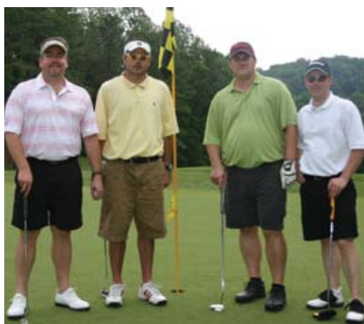
Pictured at right, top to bottom: First Place finishers for the AM Flight, Riverbound Café; First Place finishers in the PM Flight, AMF Bowling Worldwide, Inc.