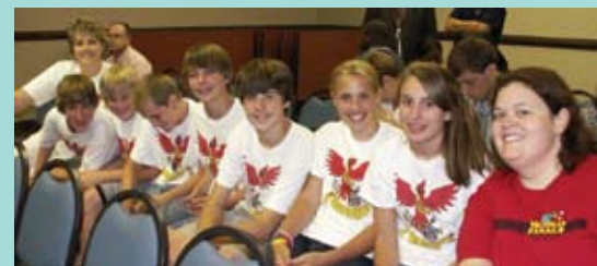
Students arrive in Maryland.

Two Oak Knoll Middle School teams from Hanover County Public Schools, who placed first and second in the State Odyssey of the Mind Competition held Saturday, April 5, 2008 advanced to the OM World Tournament at the University of Maryland on May 31 to June 3. The students and their coaches worked hard all year perfecting their solution to their OM problems, DinoStories and Eccentrics.