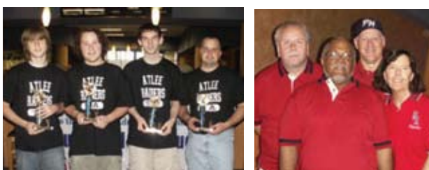
Top: First place team from Cavalier International; Below, left to right: Second place team, Atlee Rolling Raiders; Third place team from The Supply Room Companies