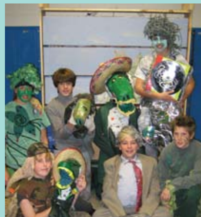
Students waiting anxiously to perform.

The Hanover Education Foundation was proud to be one of the sponsors for the OM World Championship in Maryland. Congratulations Oak Knoll OM Teams!